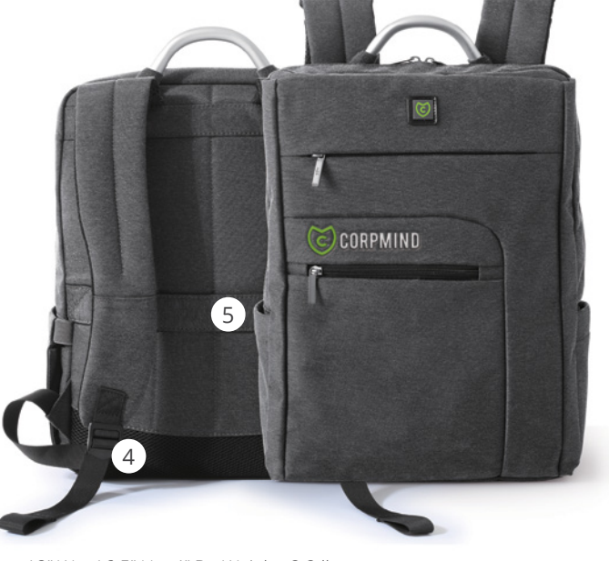
Color: Gray · Material: 230D PVC twill polyester oxford fabric · Measurements: 12" W \times 16.5" H \times 4" D · Weight: 2.2 lbs · Branding: Embroidery or domed label · Packaging: Plastic ploy bag